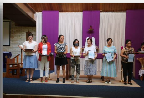
All Service Awardees Names shown below